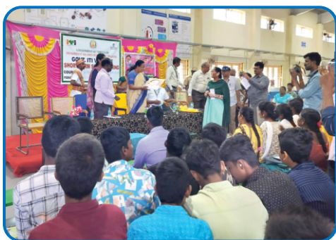
The Collector inaugurating the programme

Representatives from various educational and vocational training institutions provided insights into the numerous career opportunities available to the children. The program assisted the students in identifying their strengths and in selecting suitable career paths.